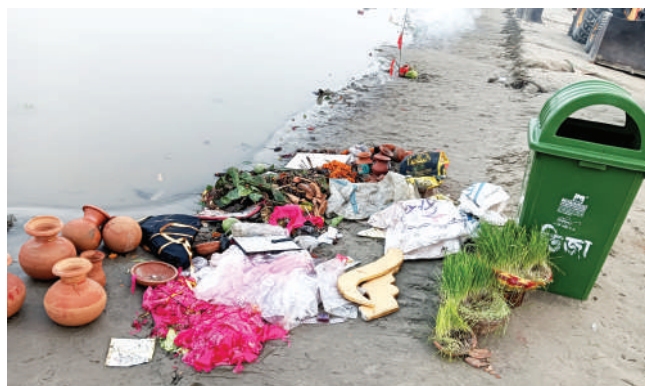
Segregation of non-biodegradable waste by Green Globe NGO before idol immersion

polluting the river. This hands-on approach ensured that no harmful substances entered the water, making this year's immersion ceremony both meaningful and environmentally sustainable.