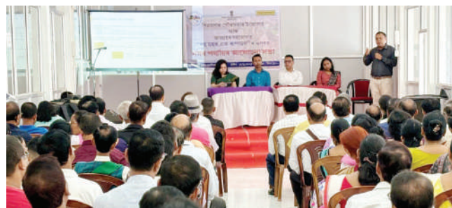
First City Council Meeting held at Sivasagar