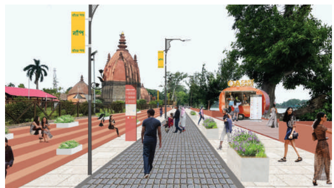
Proposed intervention behind Shiva Dol