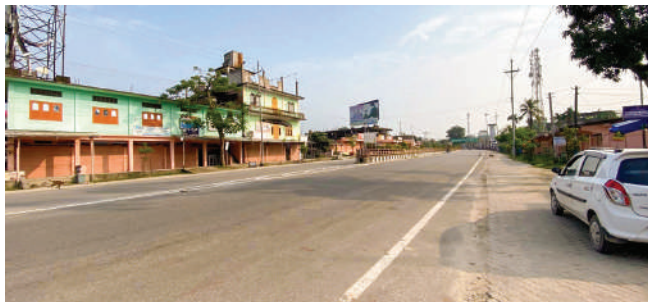
A view of the Narayanpur town