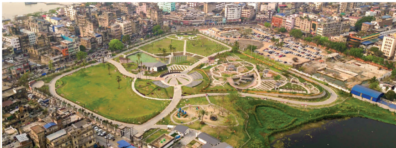
Aerial view of Adabari Park in Guwahati City