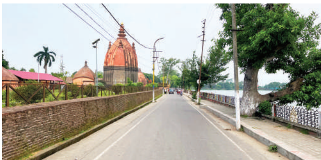
Existing stretch behind Shiva Dol