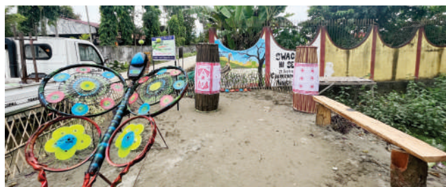
Transformation of a CTU in Chapakhowa town under the 'Swachta Hi Sewa' Mission

In Chapakhowa, several initiatives have been introduced, including public seating to encourage community engagement, a waste-to-art display that promotes recycling, and decorative elements featuring traditional Assamese Dhol symbols. A wall painting depicting a unique stork from the Sadiya region emphasizes its ecological importance, while efforts are underway to establish a local book stand to promote community reading and creative use of the space which was previously a dumpsite.