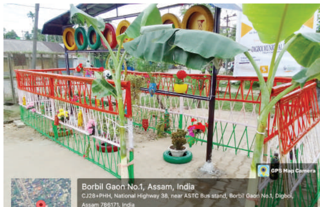
Transformation of a CTU at Digboi Town under the 'Swachta Hi Sewa' Mission

In Digboi, regular awareness campaigns were held around the town involving NCC cadets from local colleges, however waste disposal issues continued around the main bus stand. Persistent efforts led to the transformation of the CTU into a selfie point at the public bus stand, using a cost-effective waste-to-art approach.