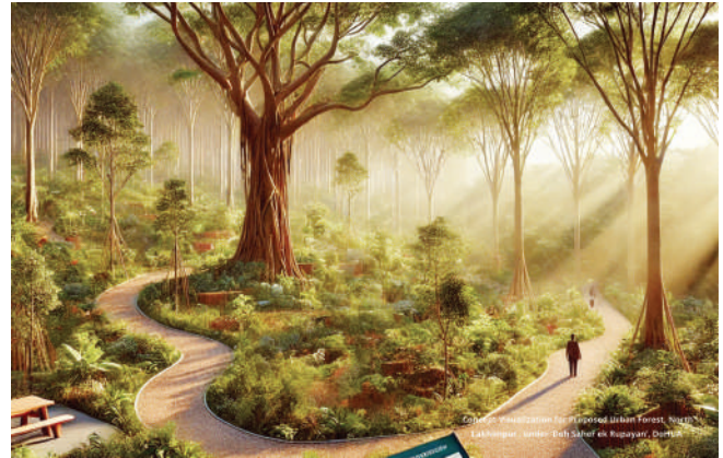
Conceptual visualisation of Proposed Urban Forest using the Miyawaki method in North Lakhimpur

wonder" ethos. The initiative exemplifies how urban forests can elevate living standards while tackling environmental concerns, serving as a blueprint for sustainable urban renewal.